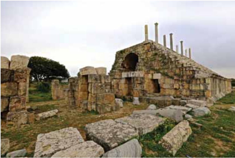
Tyre - South Lebanon