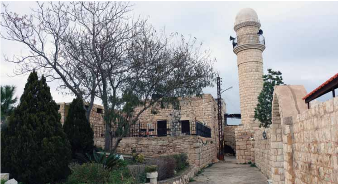
Shamaa - South Lebanon

The restorer teams trained 80 Lebanese technicians. Two types of advanced cleaning laser machines were imported from Italy in Lebanon for the first time, among other new equipment.